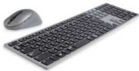
Dell Premier Multi-Device Wireless Keyboard and Mouse - KM7321W

Work from anywhere with this Bluetooth Teams certified headset that lets you switch seamlessly to your PC or smartphone and enjoy crystal clear audio on the go.