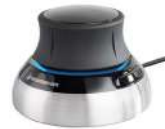
3Dconnexion SpaceMouse Wireless - 3DX-700076

Multi-task seamlessly across 3 devices with this premium full-size keyboard and sculpted mouse combo featuring programmable shortcuts and 36 months battery life.