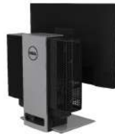
Dell Small Form Factor All-in-One Stand - OSS21

Experience vibrant color and reduced harmful blue light emissions with ComfortView Plus. Featuring an RJ45 port for Ethernet connectivity.