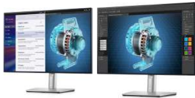
Dell UltraSharp USB-C Hub Monitor - U2421E

Experience vibrant color and reduced harmful blue light emissions with ComfortView Plus. Featuring an RJ45 port for Ethernet connectivity.