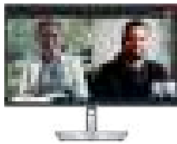
Dell 27 Monitor - P2723D

Create your ideal workspace with these recommended accessories.