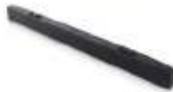
Dell Slim Soundbar - SB521A

Stay focused on a 27-inch QHD monitor optimized to deliver high performance details and clarity.